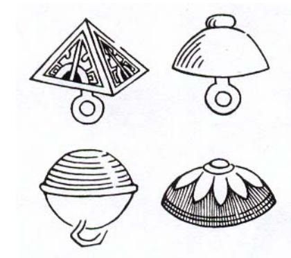
Figure 563. Pyramidal and Half-Sphere Buttons, 1300

The most informative source on buttons I have found is Textiles and Clothing c. 1150- c.1450 (Medieval Finds from Excavations in London) by Crowfoot, Pritchard, and Staniland. Not only are there photos of cloth